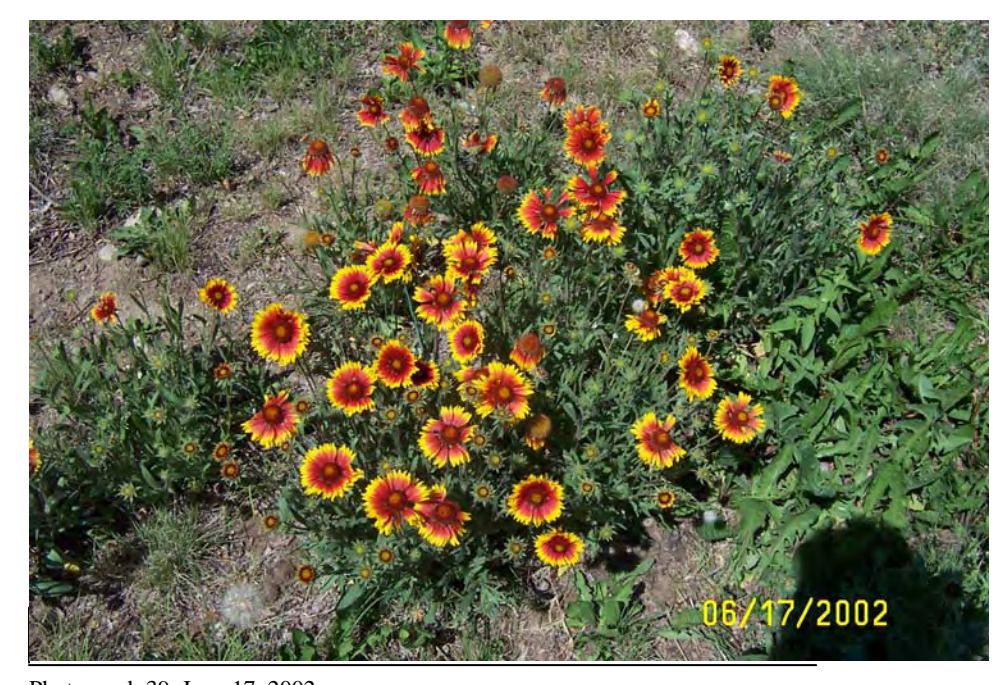
Photograph 39. June 17, 2002.