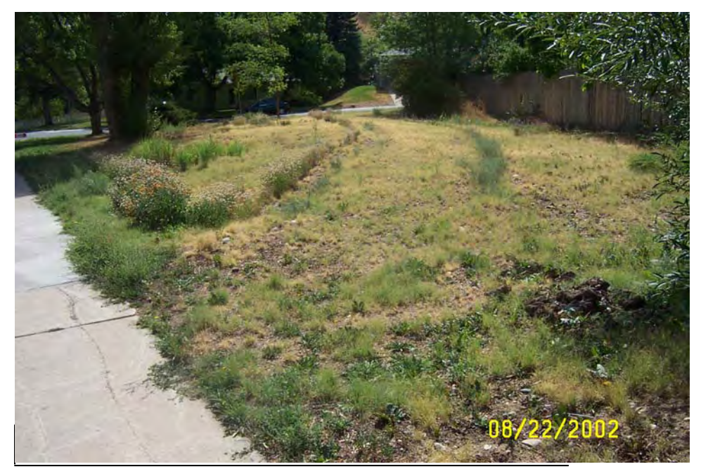
Photograph 43. August 22, 2002.