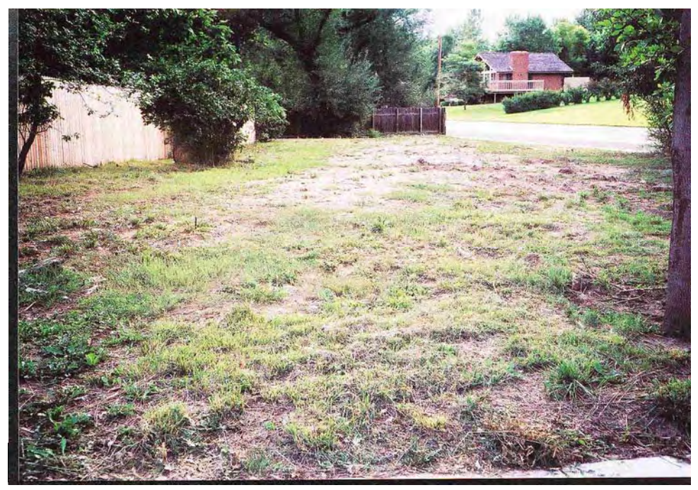
Photograph 1. Northwest-facing view toward Alpine Street Summer 1999.