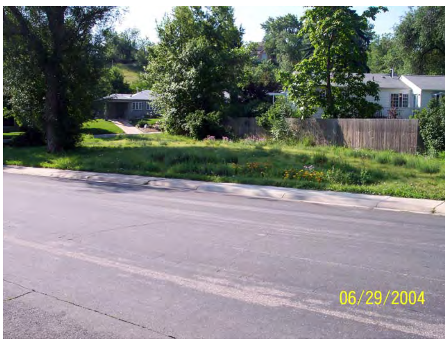
Photograph 46. June 29, 2004.