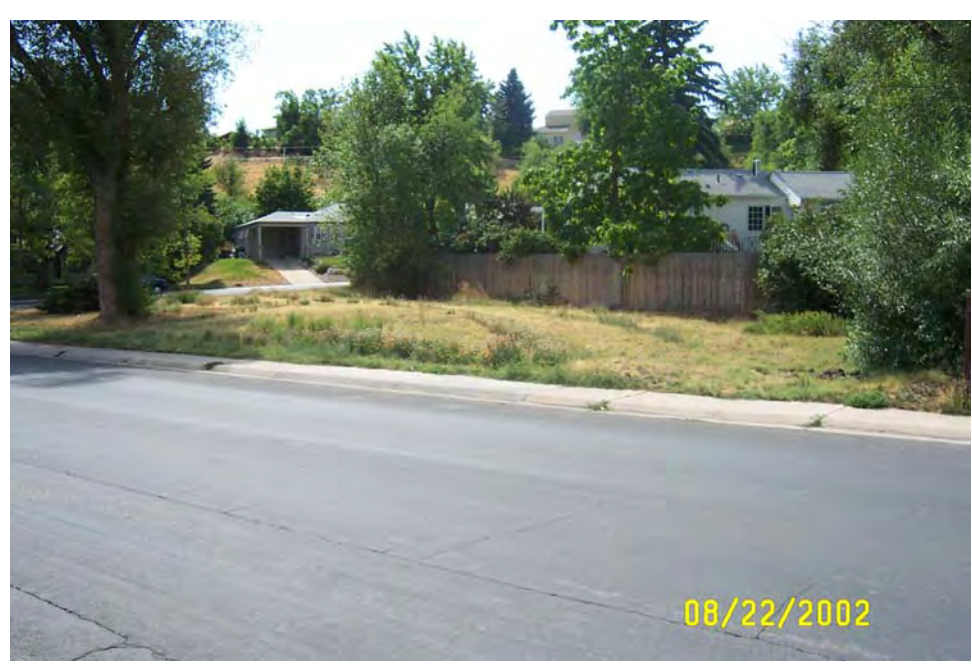
Photograph 42. August 22, 2002.