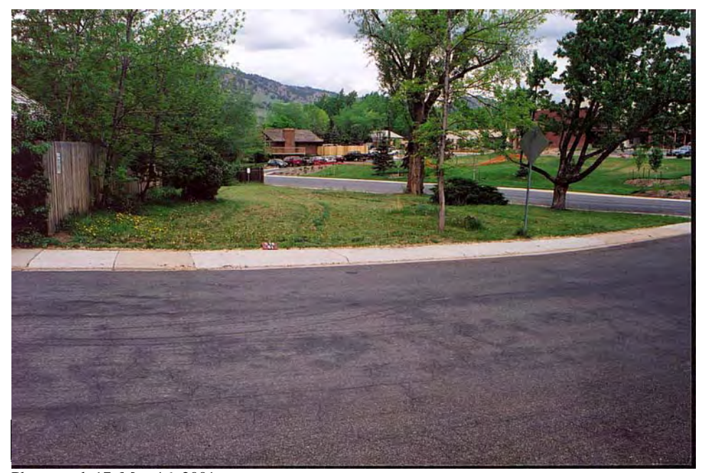
Photograph 17. May 16, 2001.