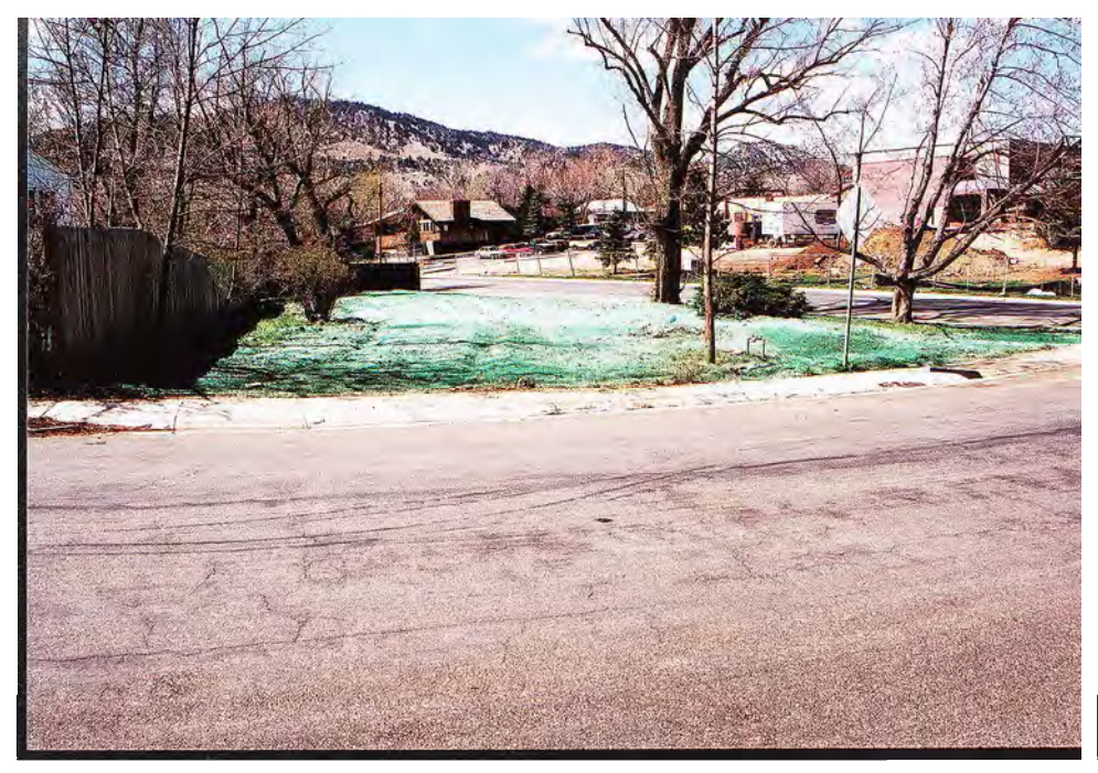
Photograph 5. After application of seed and hydraulic mulch. April 2000.