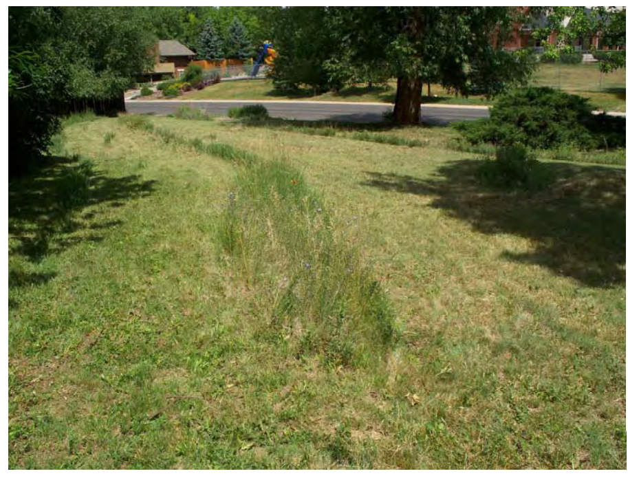
Photograph 49. June 22, 2007