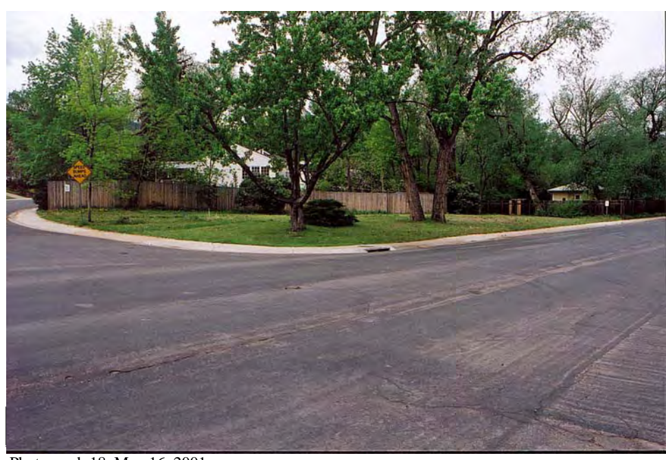
Photograph 18. May 16, 2001.