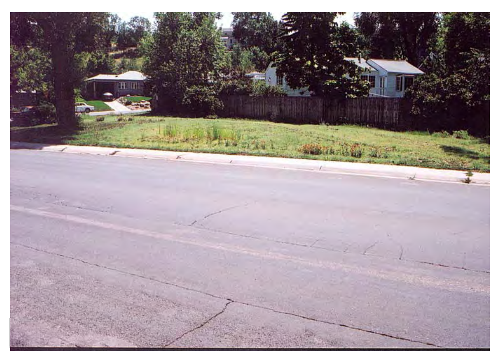
Photograph 35. August 18, 2001.