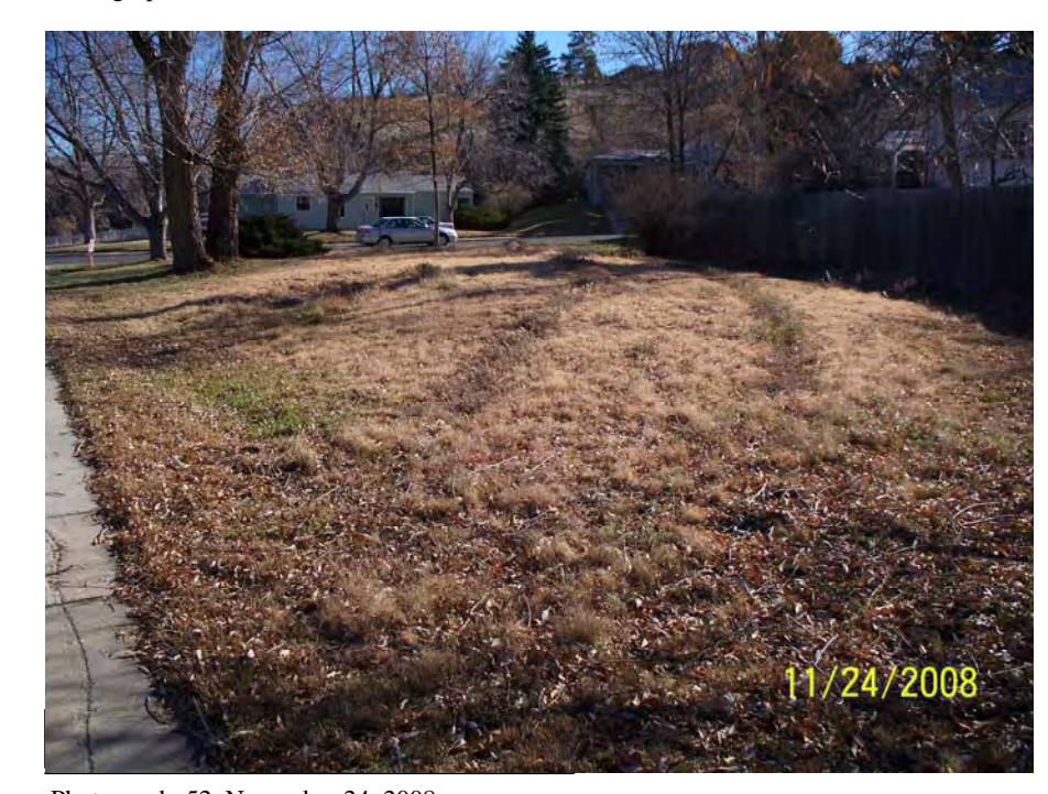
Photograph 52. November 24, 2008.