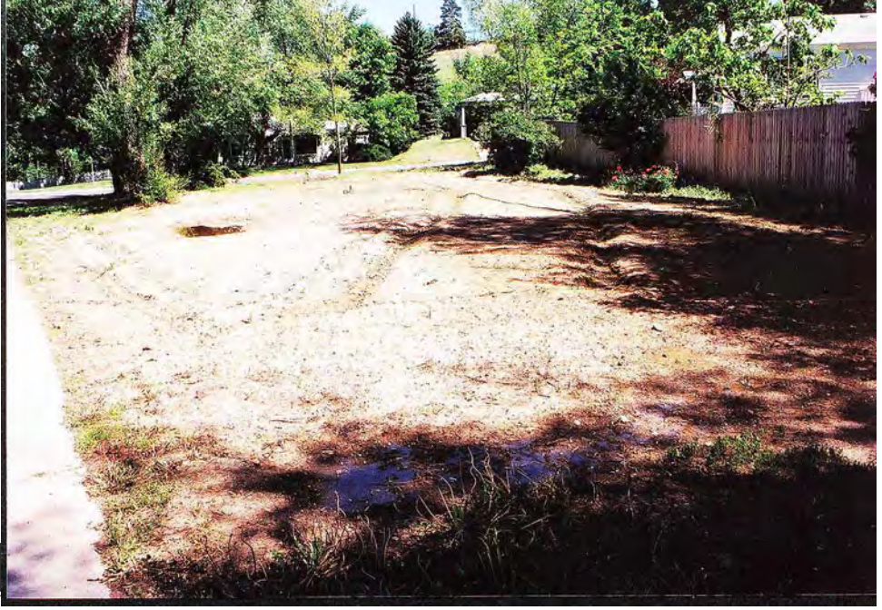
Photograph 12. June, 2000