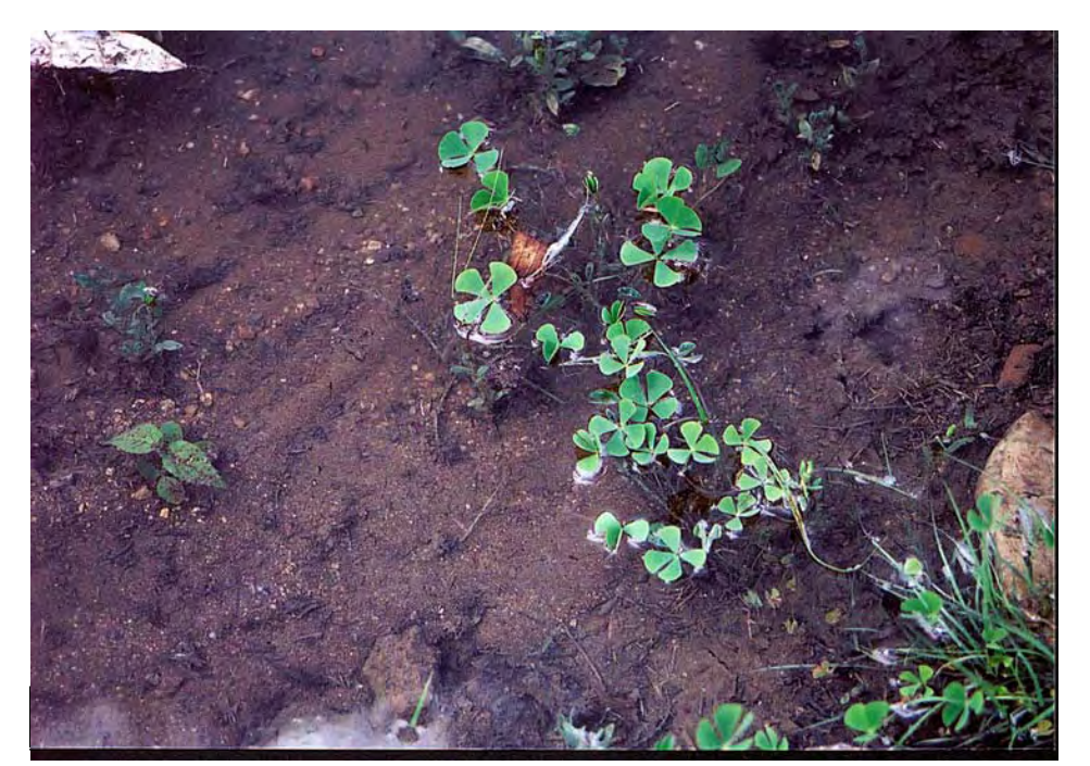
Photograph 31. July 29, 2001. This looks like a clover but it is a fern Marselia mucronata .