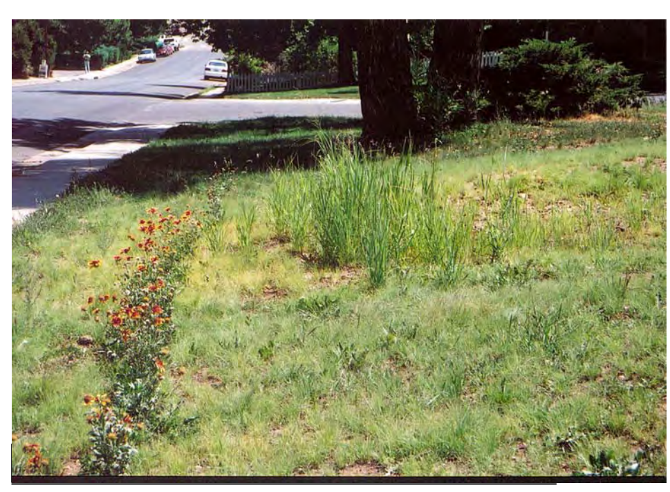
Photograph 34. August 18, 2001.