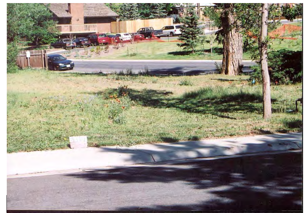
Photograph 22. June 11, 2001.