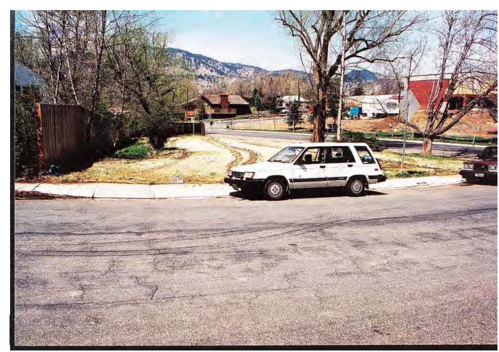
Photograph 7. After planting additional flower seed and hawthorn. April 16, 2000.