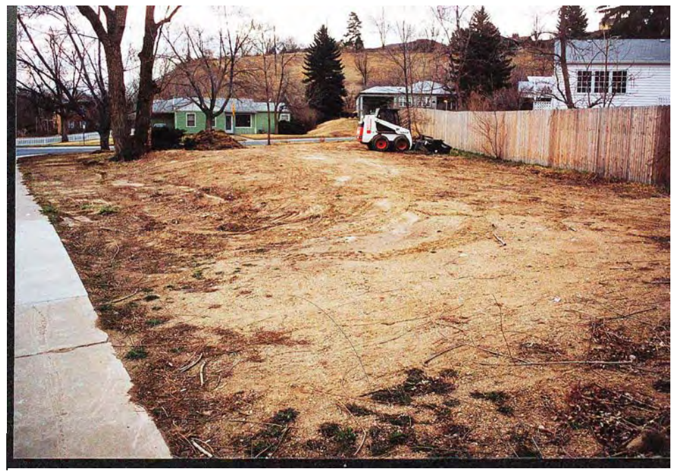
Photograph 4. Site preparation. No topsoil was added. End of March 2000.