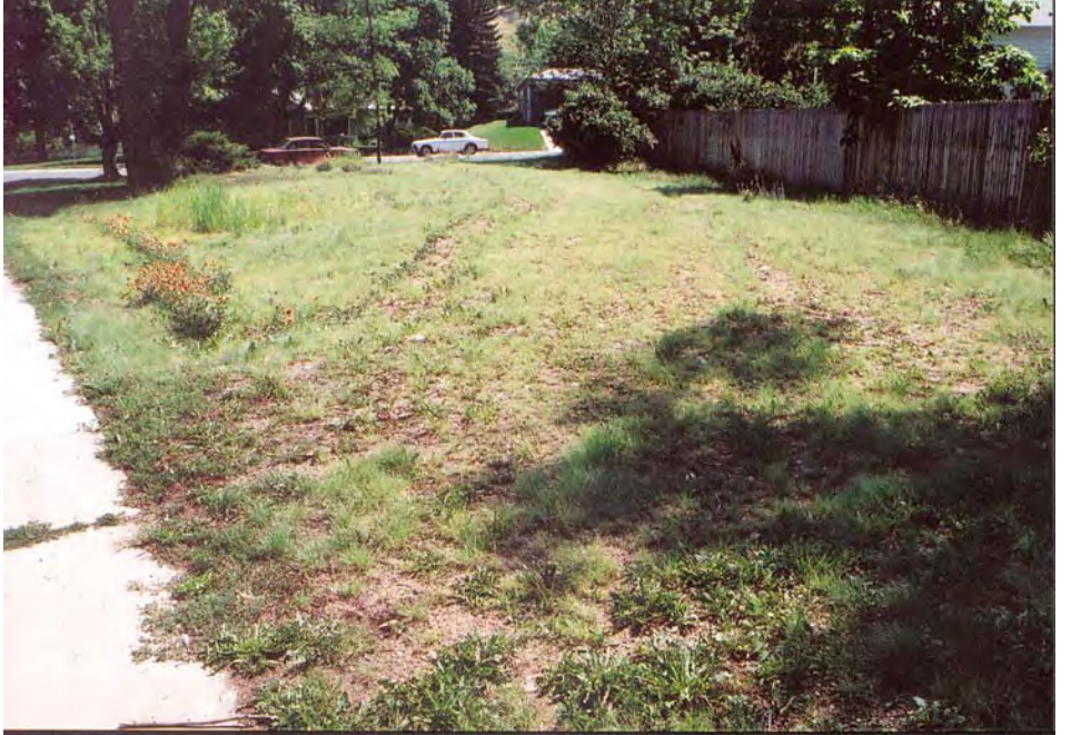
Photograph 36. August 18, 2001.