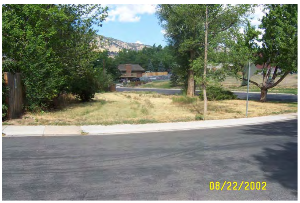
Photograph 41. August 22, 2002.