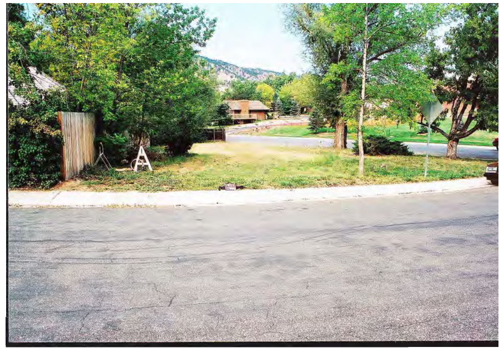
Photograph 13. October 1, 2000.