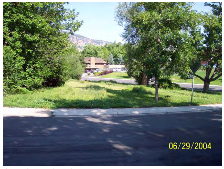
Photograph 45. June 29, 2004.