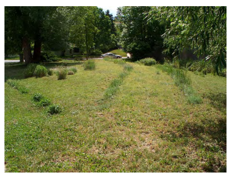
Photograph 50. June 22, 2007.