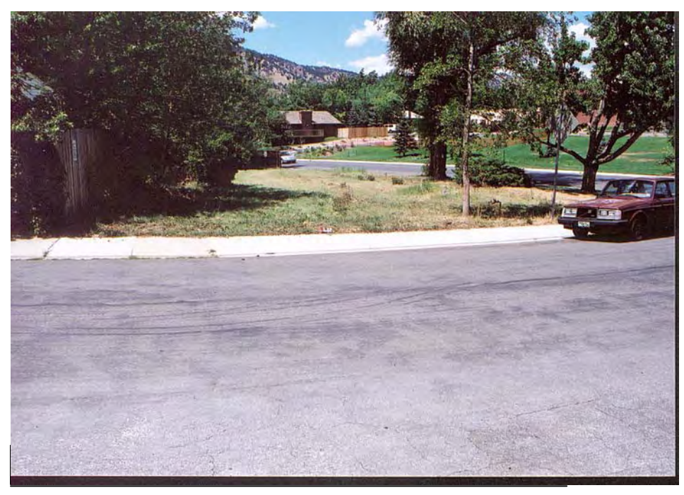
Photograph 25. July 29, 2001.