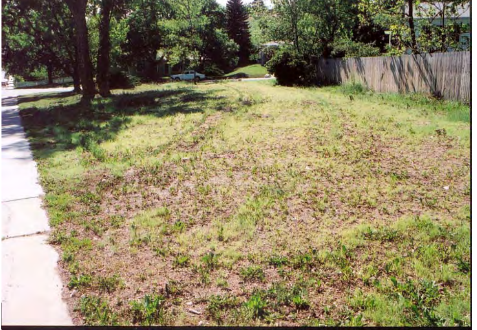
Photograph 24. June 11, 2001.