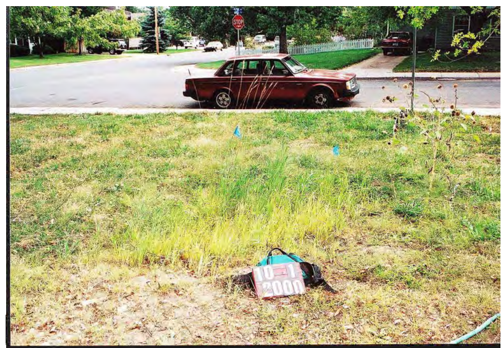
Photograph 15. October 1, 2000.