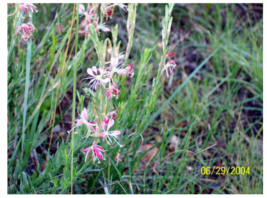
Photograph 48. June 29, 2004.