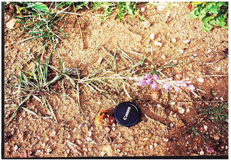
Photograph 16. Liatris punctata that was planted and flowered Summer 1999.