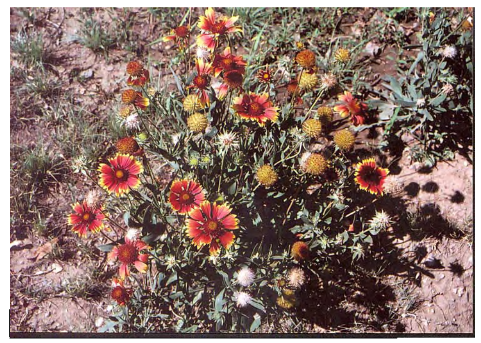
Photograph 29. July 29, 2001. Blanket flower (Gailardia pulchella)