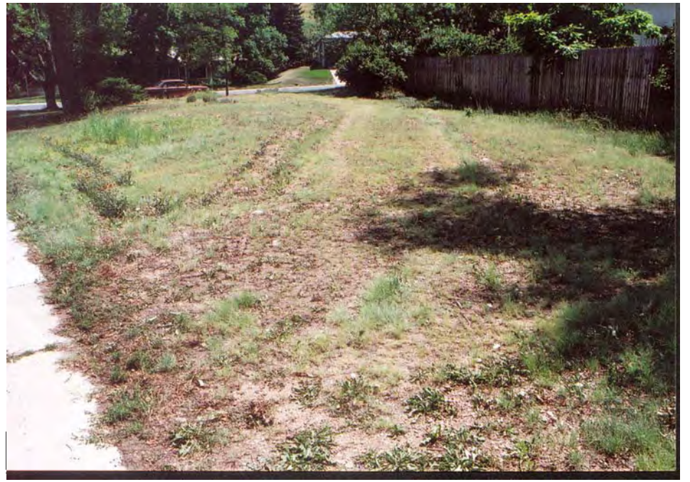
Photograph 28. July 29, 2001.