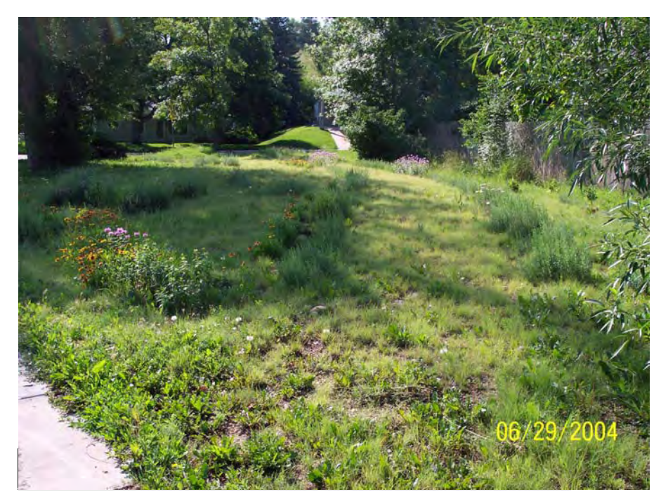
Photograph 47. June 29, 2004.