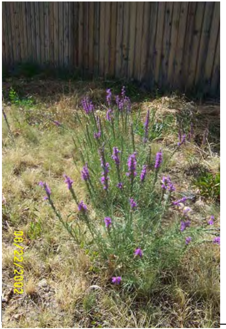
Photograph 44. August 22, 2002.