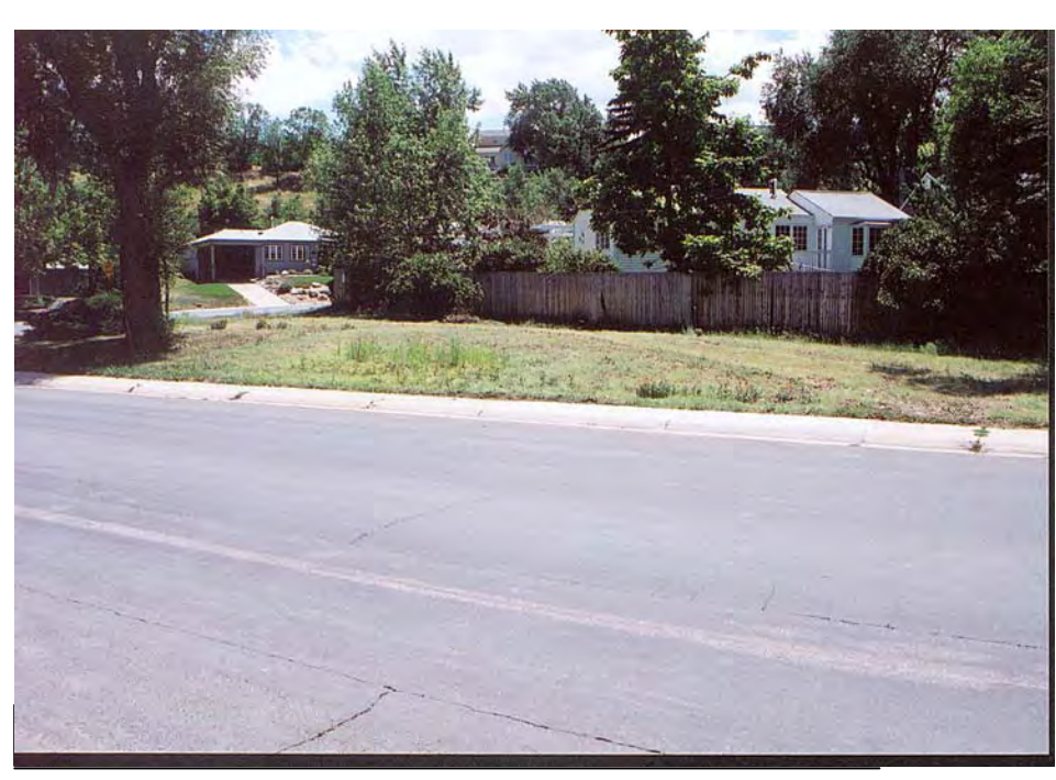
Photograph 26. July 29, 2001.