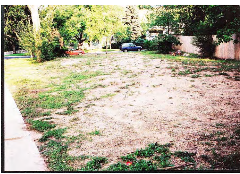
Photograph 2. Southeast-facing view toward North Street. Summer 1999.