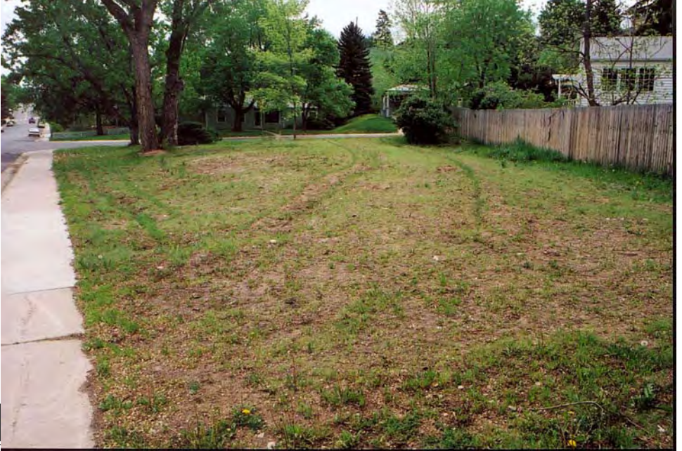
Photograph 20. May 16, 2001.