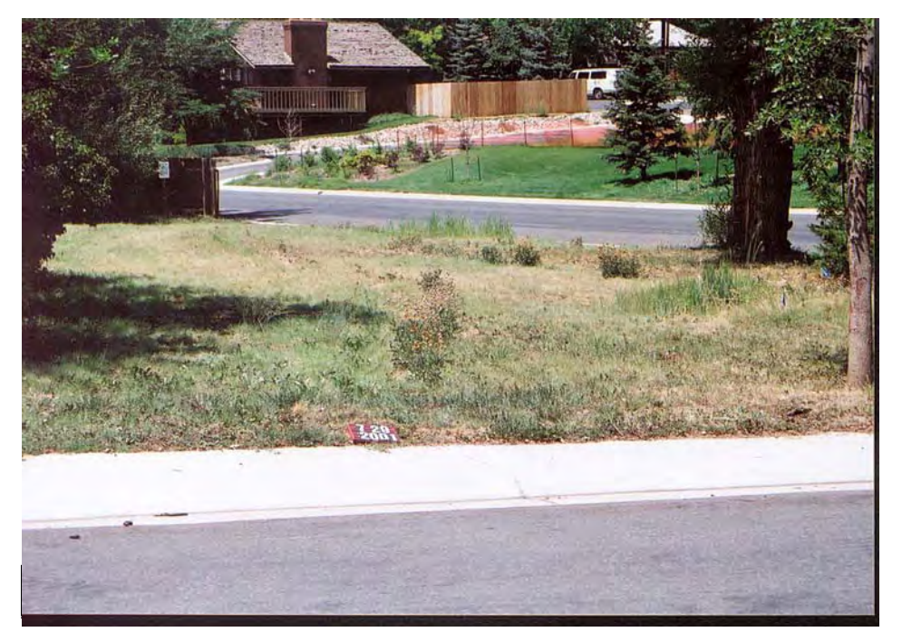
Photograph 27. July 29, 2001.