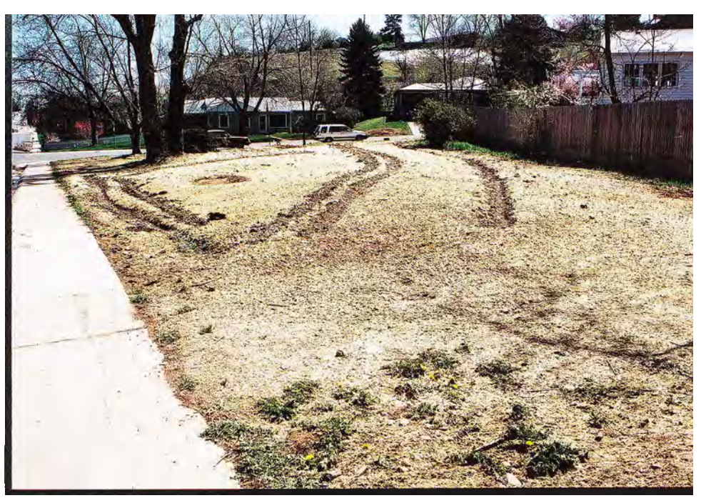
Photograph 8. After planting additional flower seed and hawthorn. April 16, 2000.