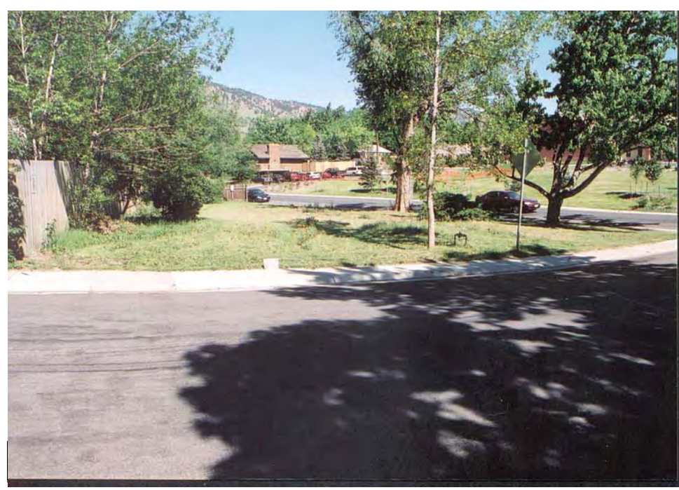
Photograph 21. June 11, 2001.