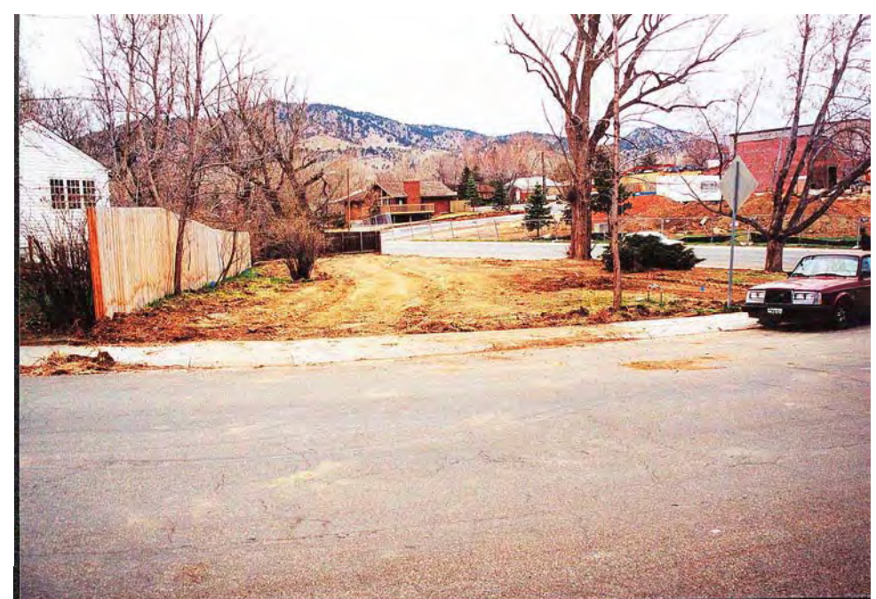
Photograph 3. Site preparation. No topsoil was added. End of March 2000.