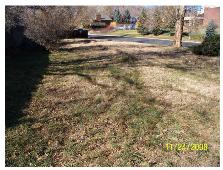
Photograph 51. November 24, 2008.