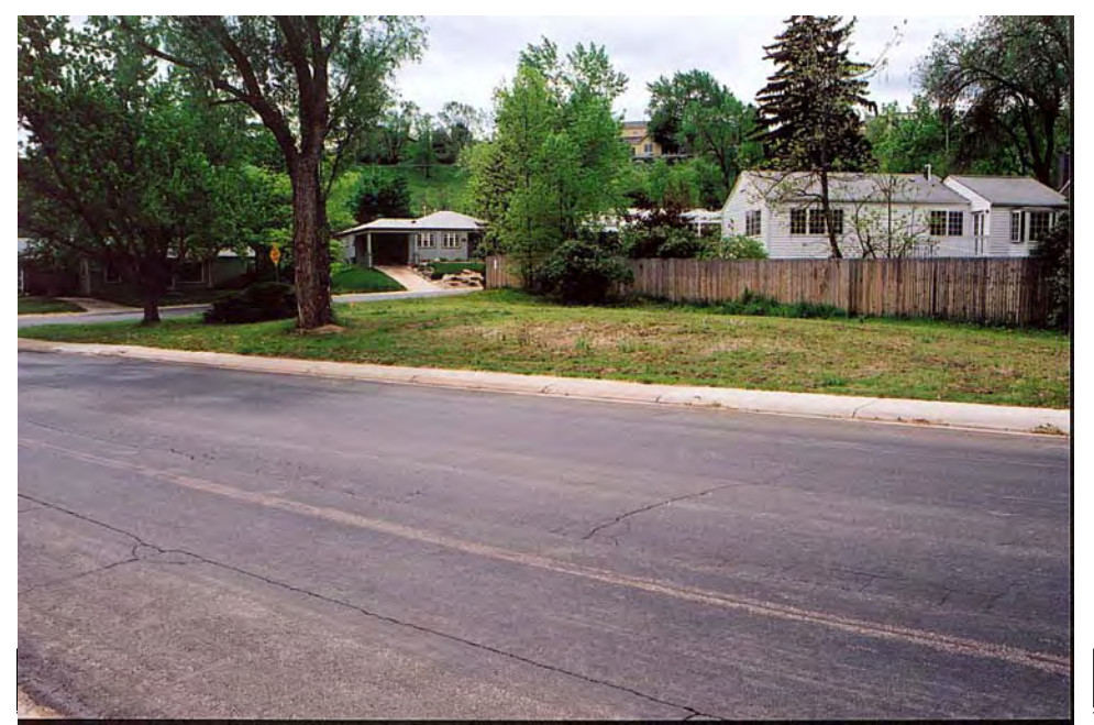
Photograph 19. May 16, 2001.