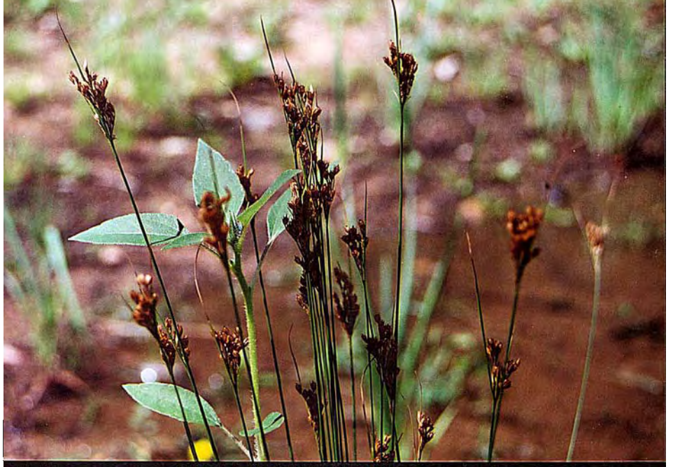
Photograph 32. July 29, 2001. A rush Juncus interior.